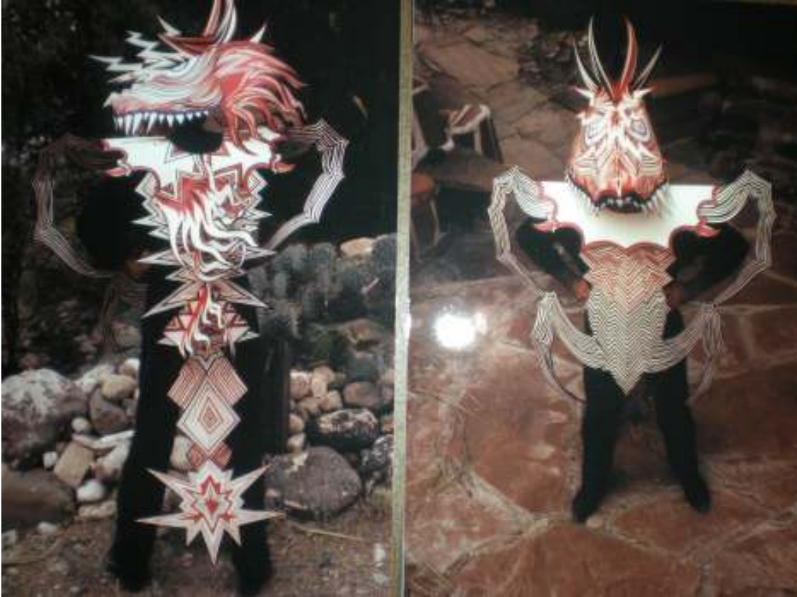
Adult's Wearable Art or Mask and Body-Suit