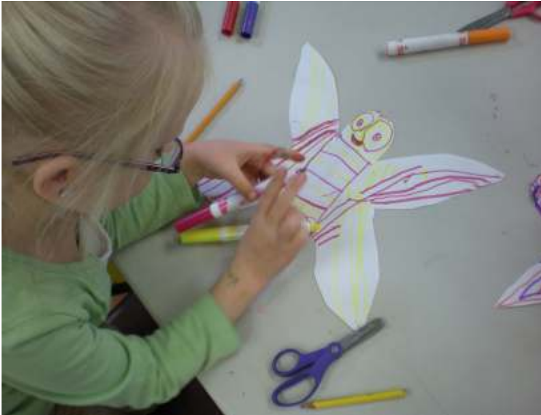
Pre - K and K : "Dizzy Bug" project, utilizing symmetrical design and 3-color patterning.

1 to 3-day projects include eye-dazzling insects and masks. 4 to 6-day projects include 3-dimensional drawings and colorful free-standing sculptures. 7 to 10-day projects may include sculptures, wearable art, masks, headdresses and body suits; sets, props and costumes for original or scripted plays, parades, and performances.