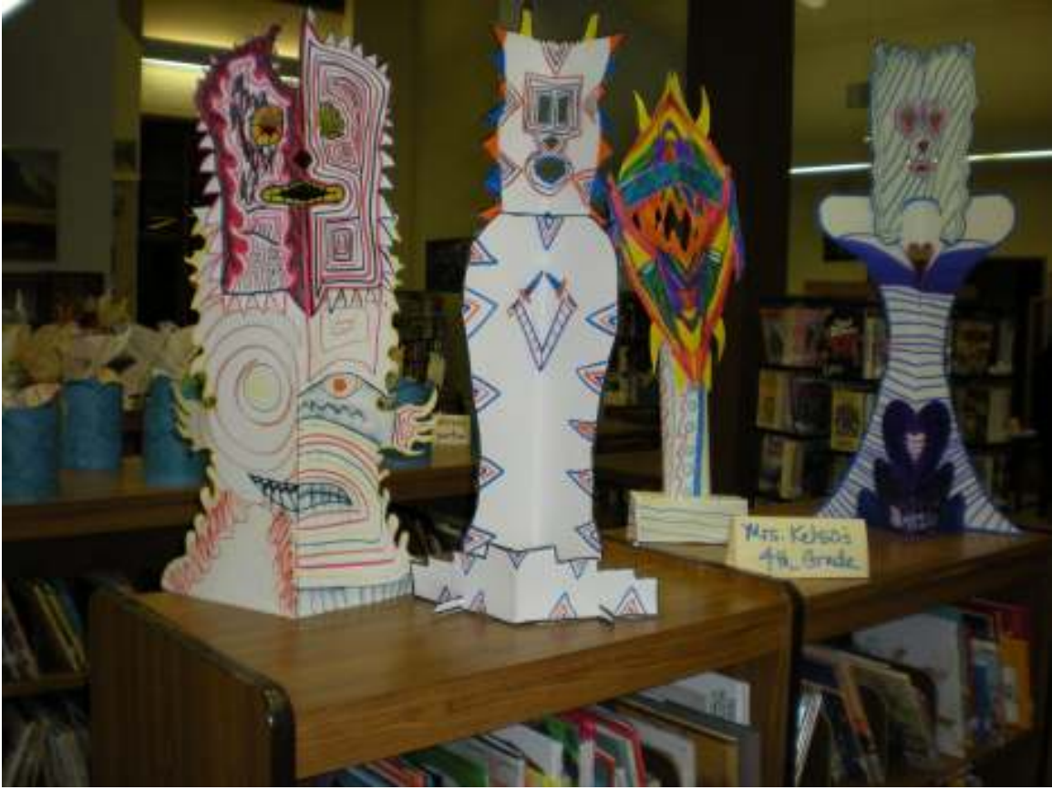
4 th Grade Sculptures