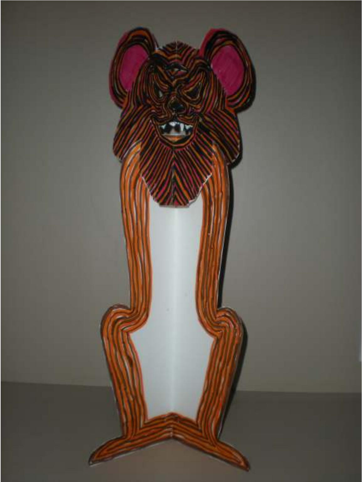
Lower Elementary Sculpture