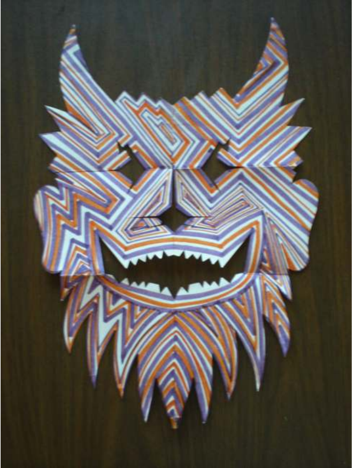
High School/Adult 3 Color Patterning and Symmetrical Design Project