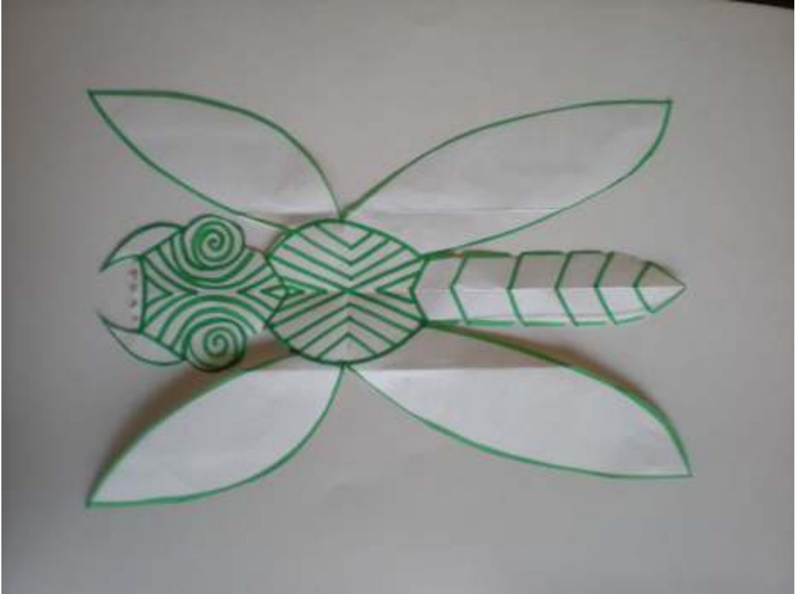
Unfinished Upper Elementary Project Sample